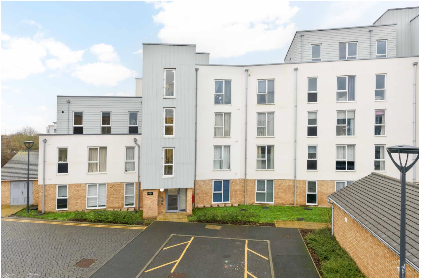
Apartment 8 Thaden Apartments Hawker Drive Addlestone Surrey KT15 2GS